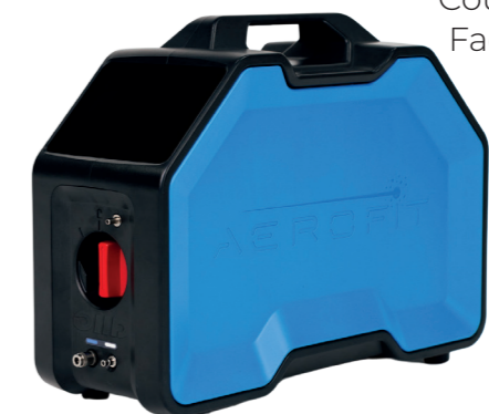
AeroFit Ambient Particle Counting (APC) Face Fit Tester